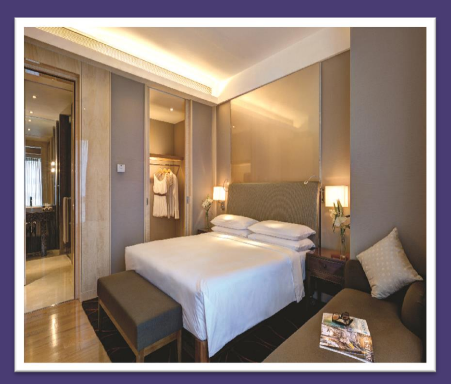
Spacious living room and bedroom

One Bedroom -65 sq m , Executive One Bedroom - 87 sq m Two Bedroom -100 sq m, Executive Two Bedroom -125 sq m