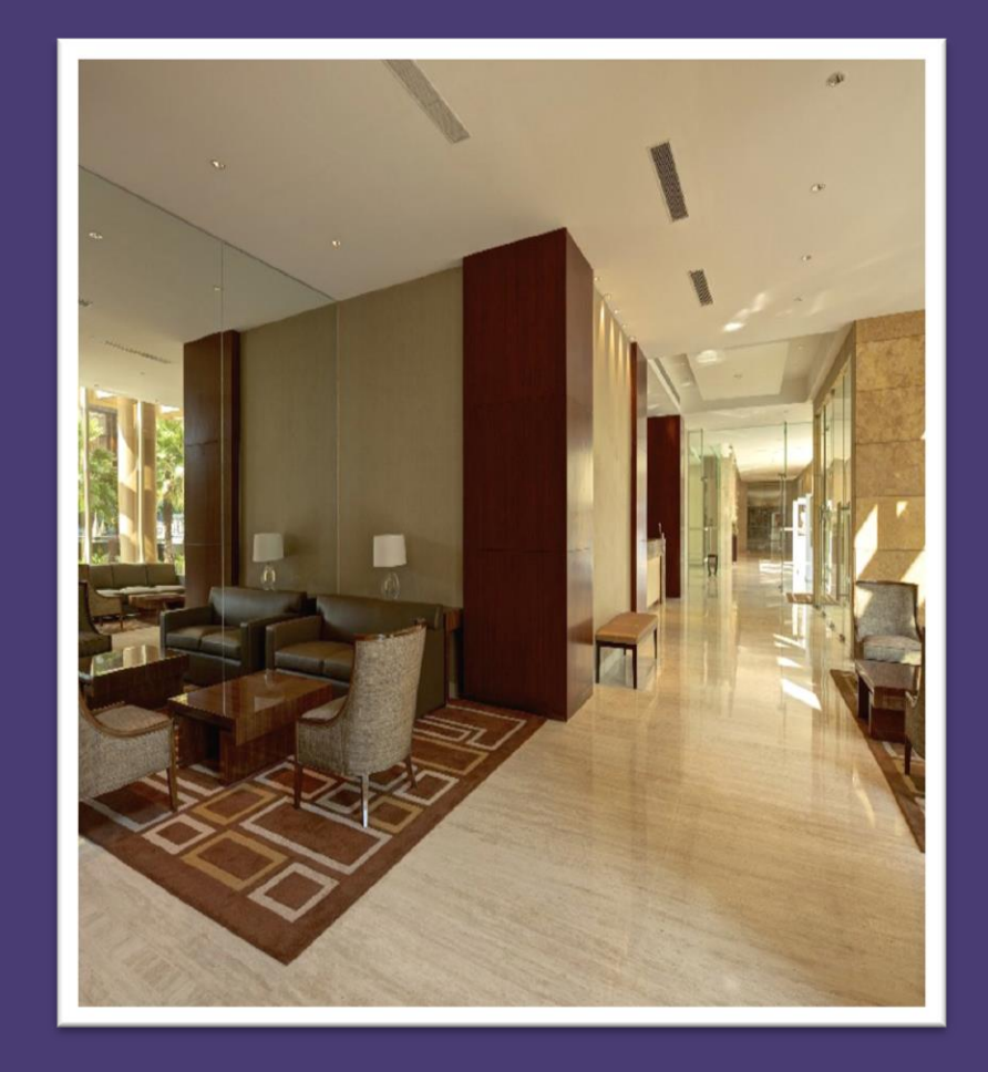
81 home-style, luxury apartments in configurations of one and two bedrooms ranging from 65 to 125 sq meters