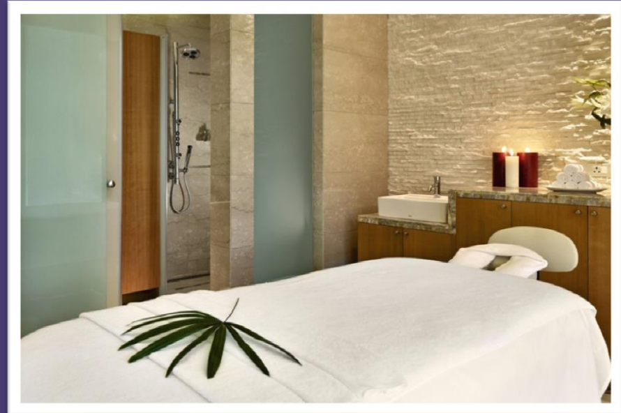
Arogya Spa & Fitness Centre

Six treatment rooms, including two couples room and an Ayurveda room