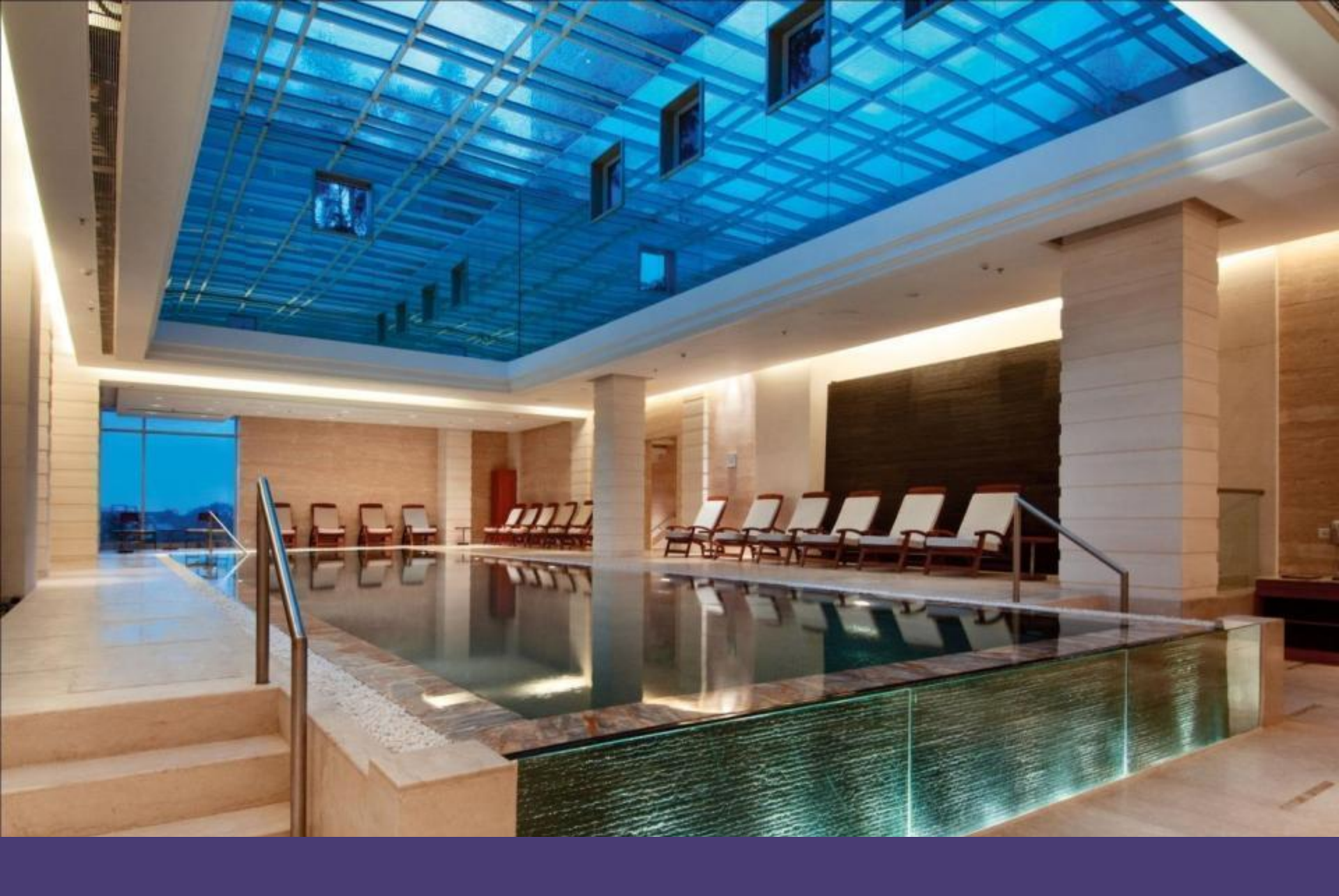
Temperature controlled indoor swimming pool with sun deck terrace