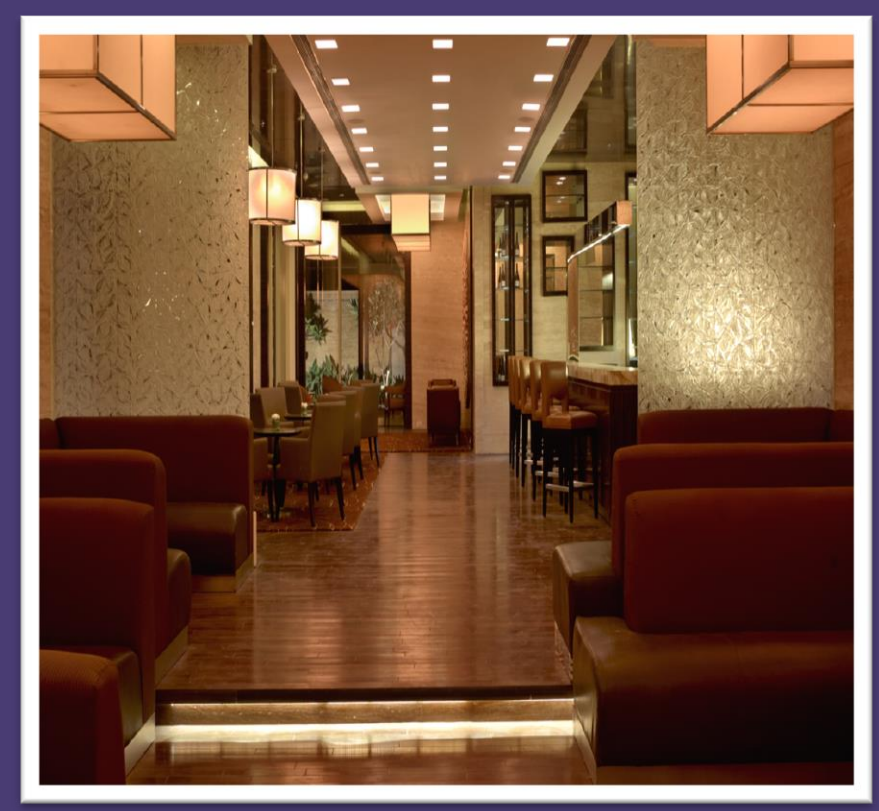
Single Malt & Co-Bar & Lounge

It is the place to meet, for hotel guests and visitors. The bar serves a connoisseur's selection of aged Single Malt whiskies and other liquors, wines, beers and cocktails