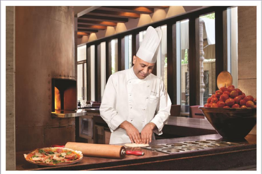
La Terrazza- Trattoria & Lounge

An award-winning home-style, Italian trattoria & lounge with indoor and outdoor seating along with an impressive wine cellar