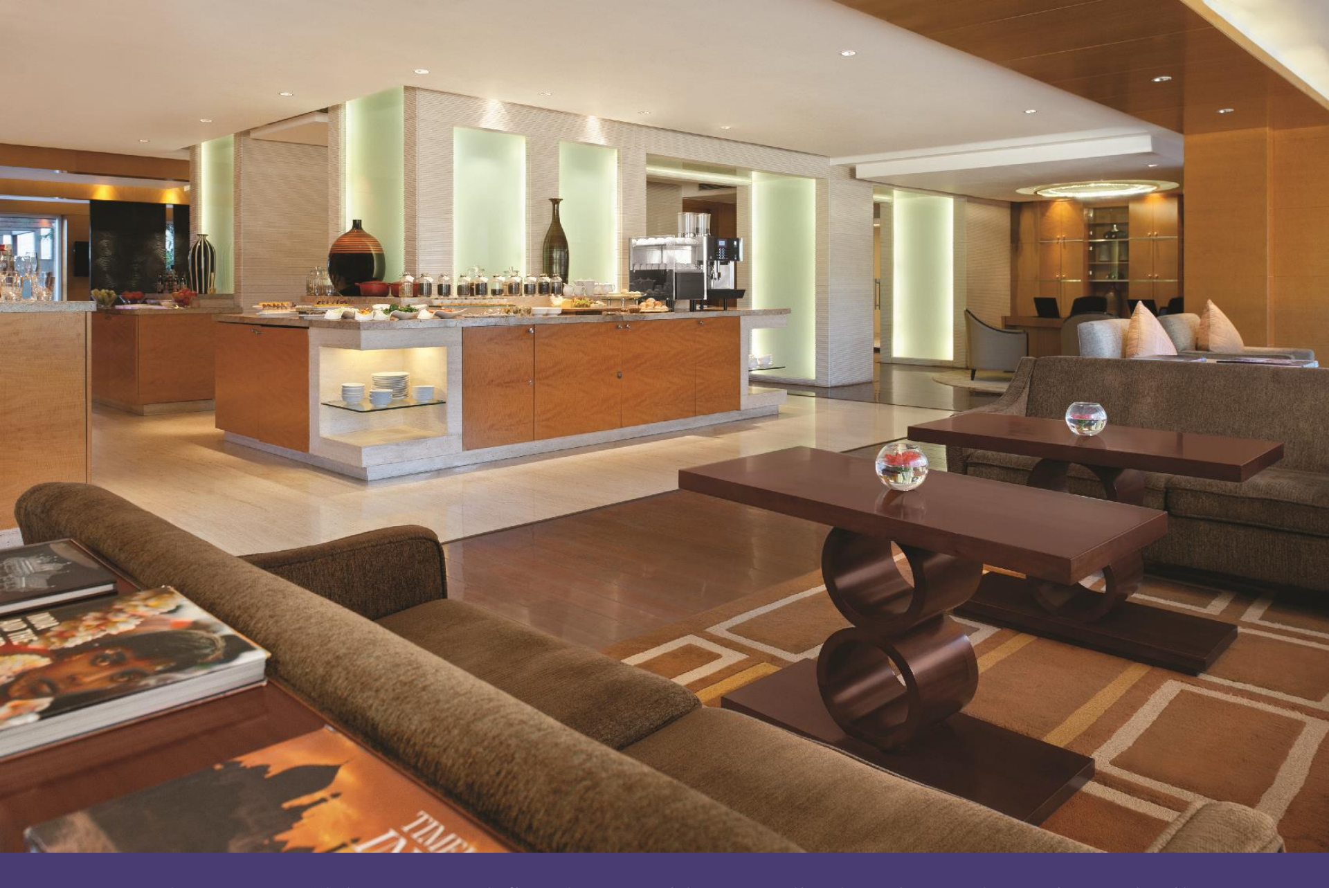
The Regency Club Lounge redefines luxury, with personalized services and attention to detail. Amenities include Continental breakfast, evening cocktails and canapés and a private meeting room