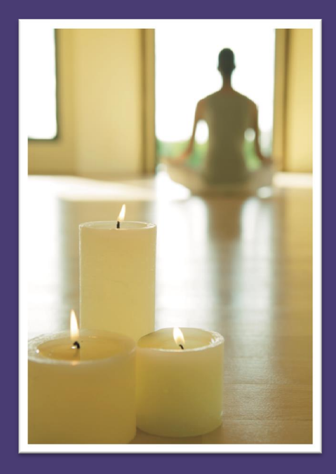
State-of-the art gymnasium and Yoga room with dedicated personal trainers, to assist you with cardio workouts and weight training