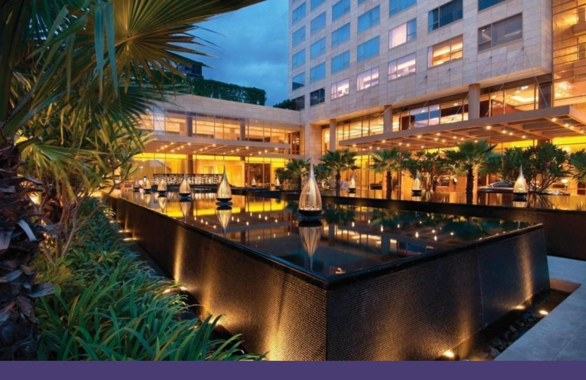
222 spacious rooms including 50 Regency Club™ rooms and 18 suites, as well as 81 fully serviced luxury apartments, Hyatt Regency Pune is an ideal destination for business and leisure travelers