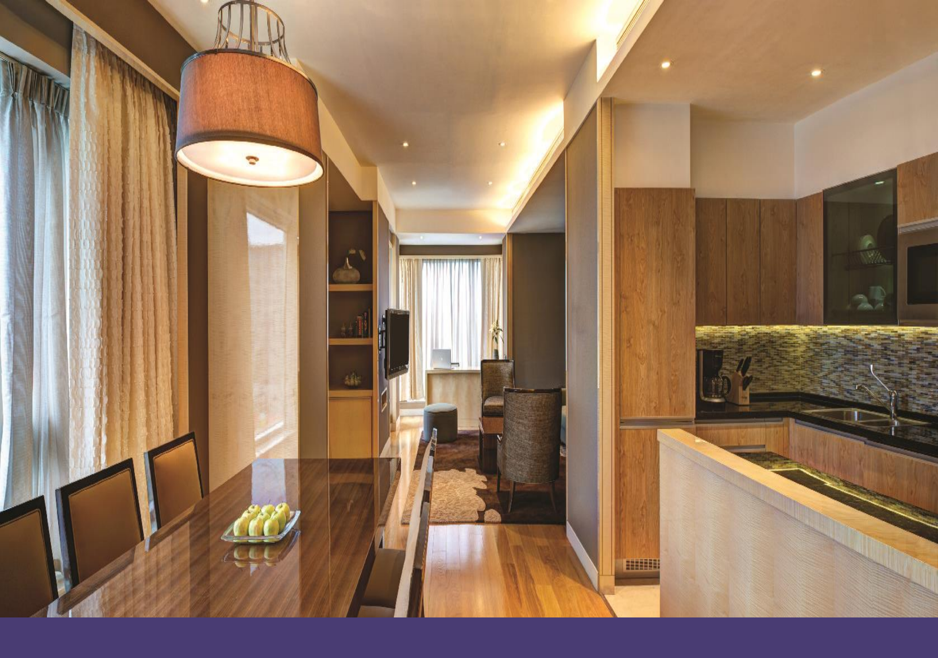
Dining room adjacent to an open kitchen