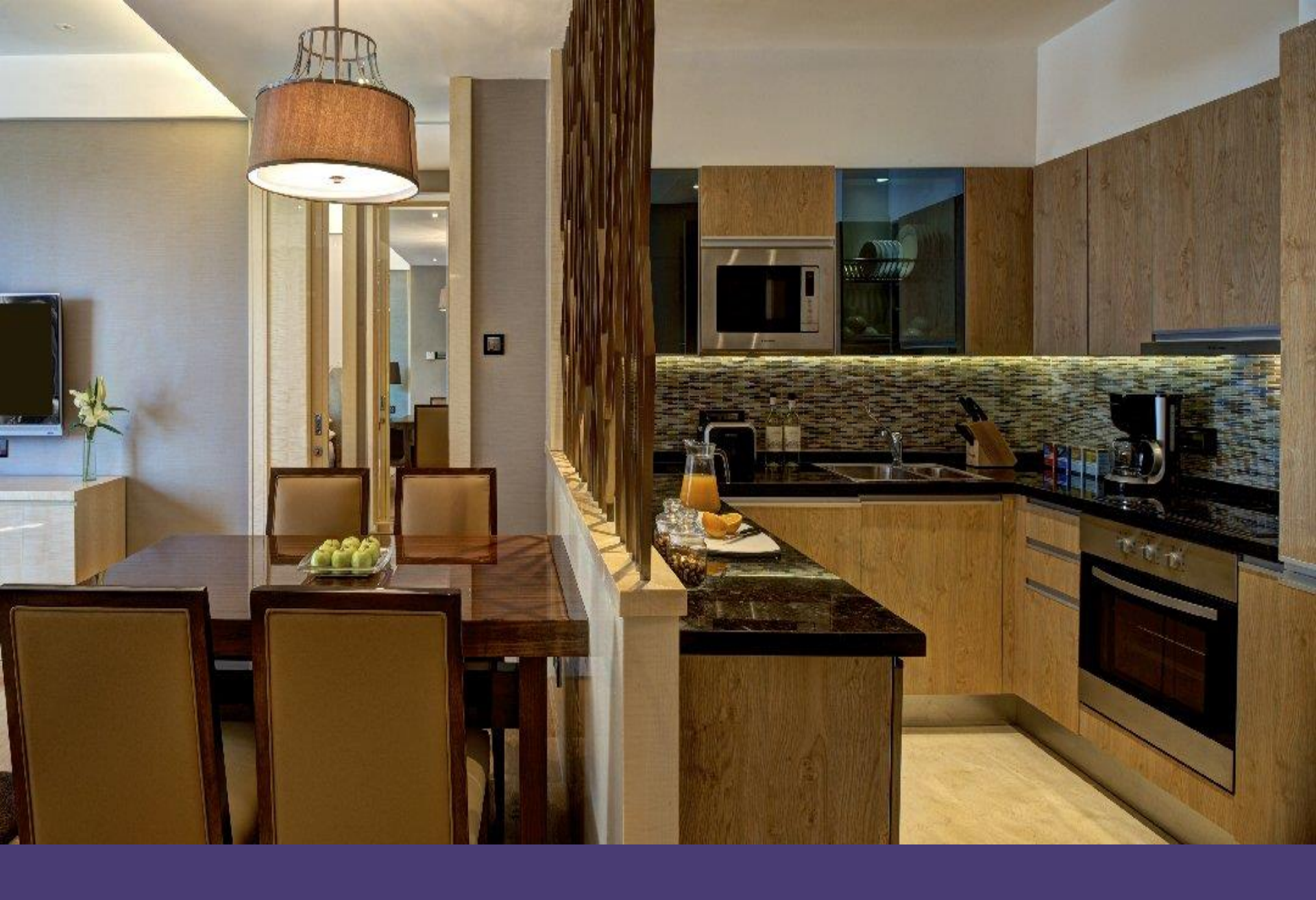
Modern kitchen equipped with high end appliances